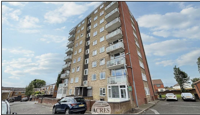
Flat 2 Allen House, Great Barr, B43 5PS